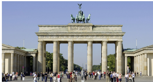
Brandenburger Tor

Kempinski Hotel Bristol Kurfürstendamm 27, 10719 Berlin